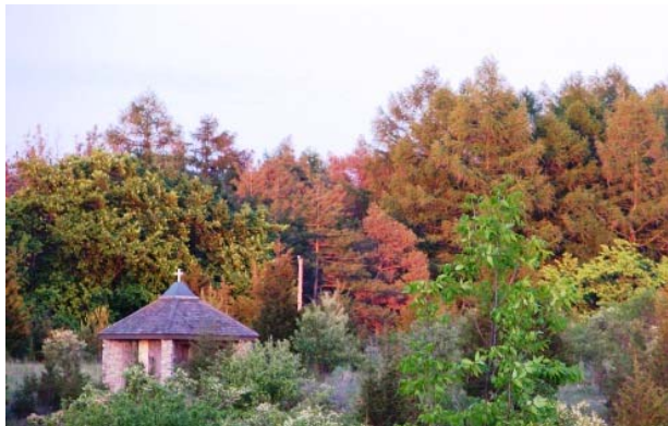
Prayer Shelter at Crieff Hills

His special areas of research include the reformation era, particularly the Scottish reformation, and change in the Canadian church since World War II.